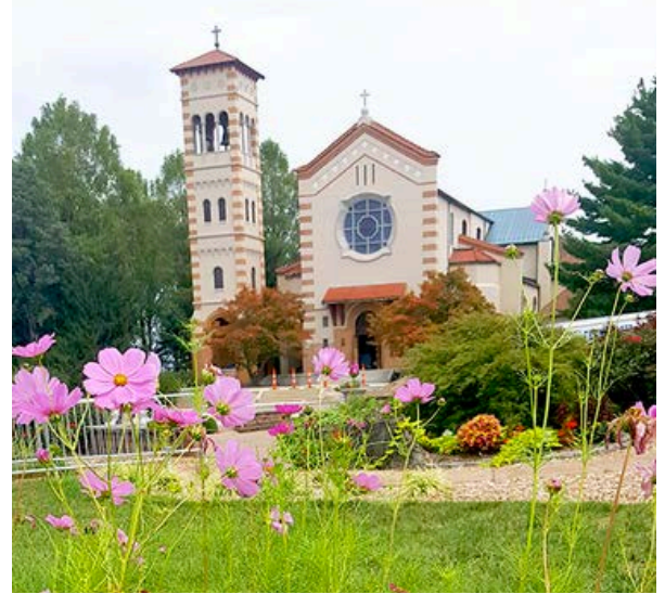
Shrine photos: amm.org