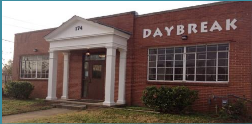
Daybreak | Macon ,GA