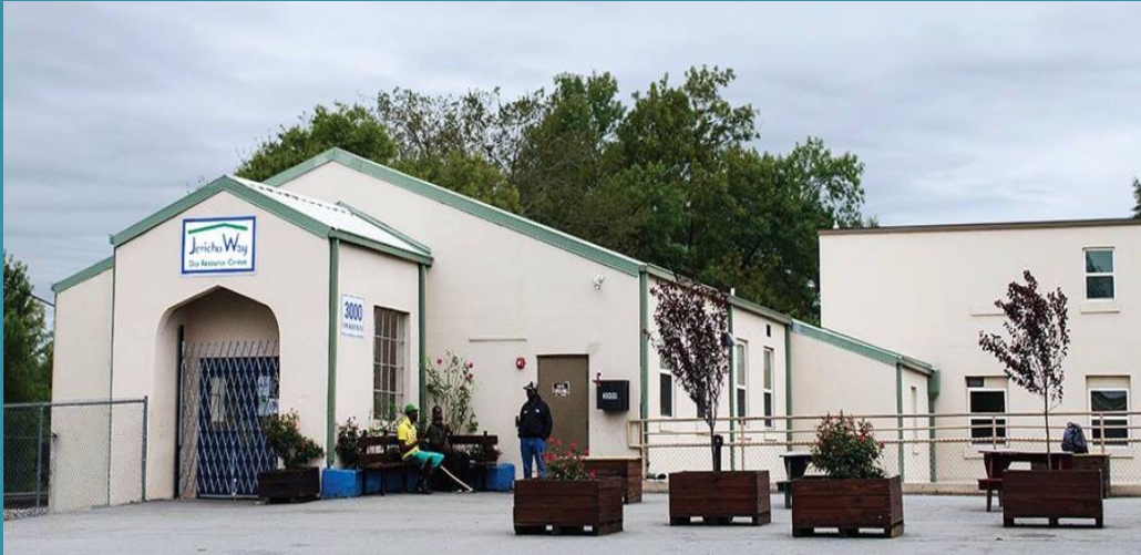
Jericho Way | Little Rock, AR

In 2021, the day centers kept their doors open. Their combined outcomes: