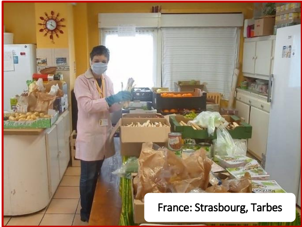
France: Strasbourg, Tarbes

The actions of AIC volunteers around the world continue to show that however difficult the situation, it is always possible to keep helping those in need.