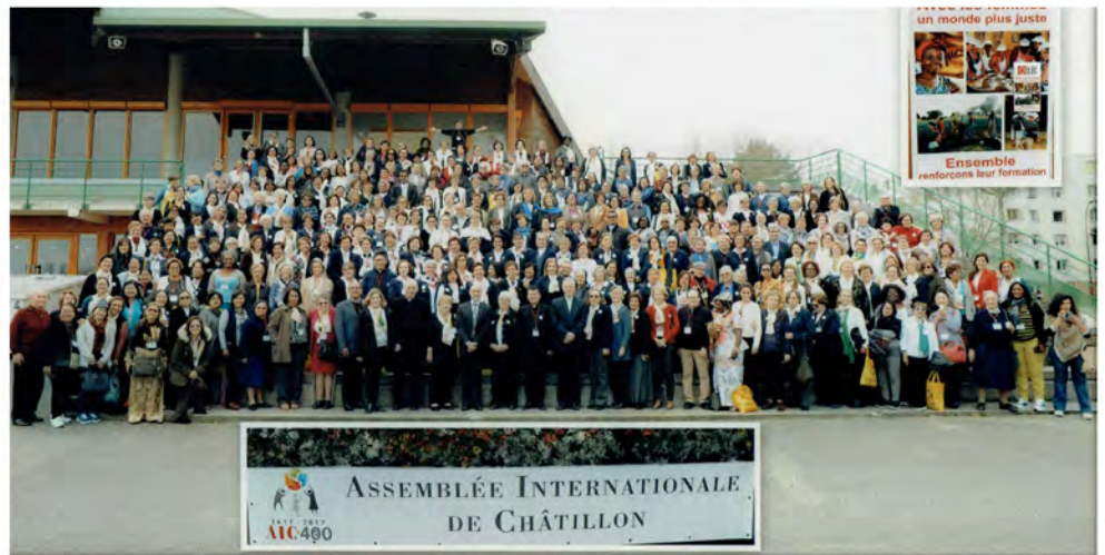
LOC who attended the France 400th celebration, 13 LCUSA members present