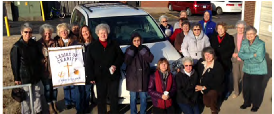
LOC and donated van – Perryville, MO