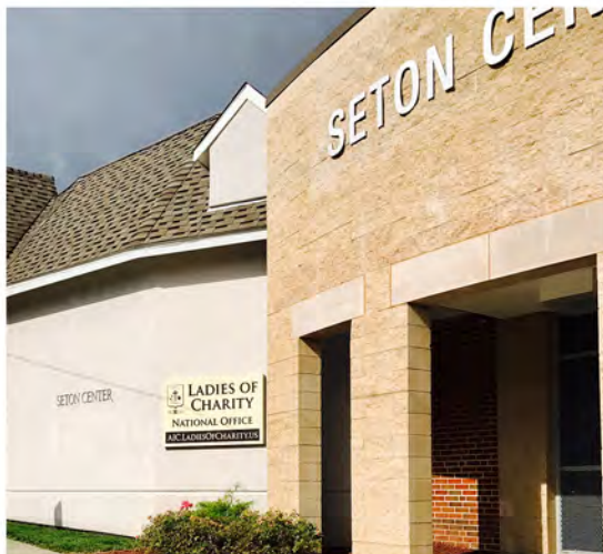
New LCUSA office at Seton Center in Kansas, MO