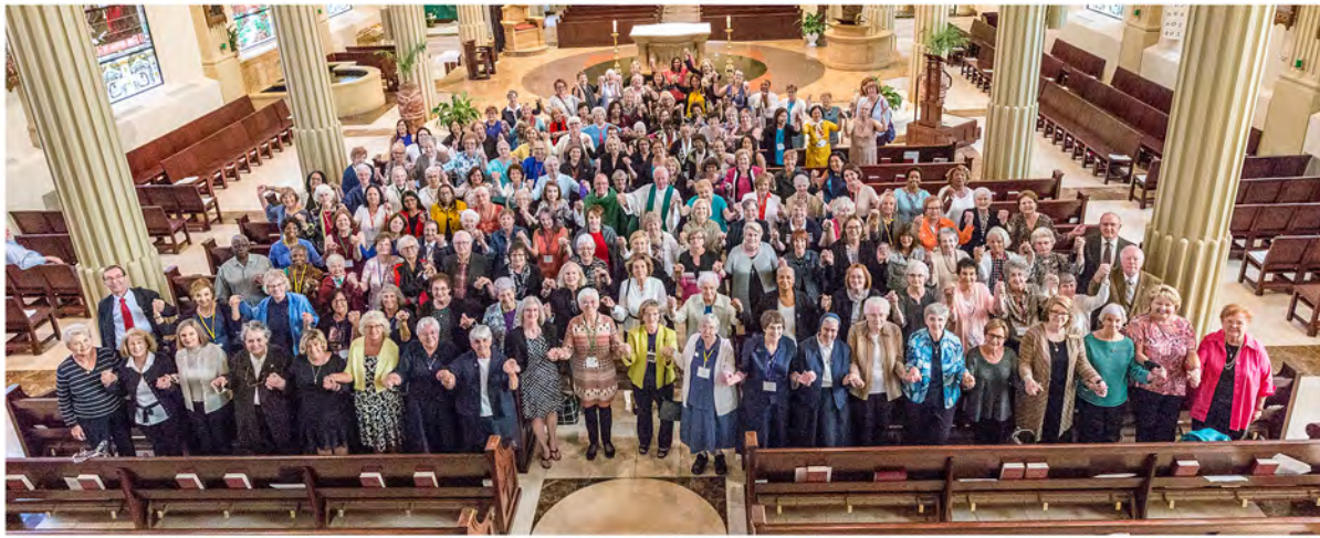
2017 Assembly Mass