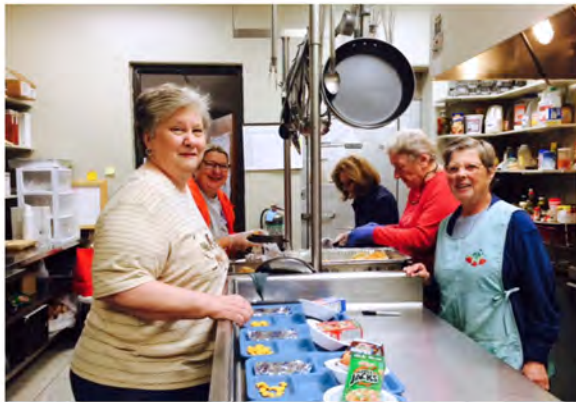
LOC prepare a breakfast bounty in Little Rock, AK