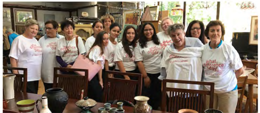
St. John's LOC and JLOC Service Day, Queens, NY