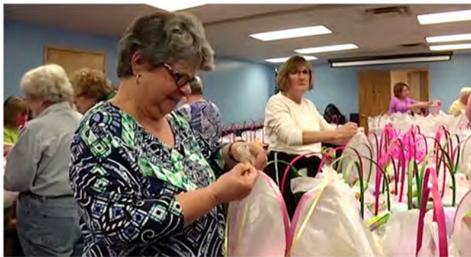
Ladies of Charity making Easter baskets in Elmira, NY