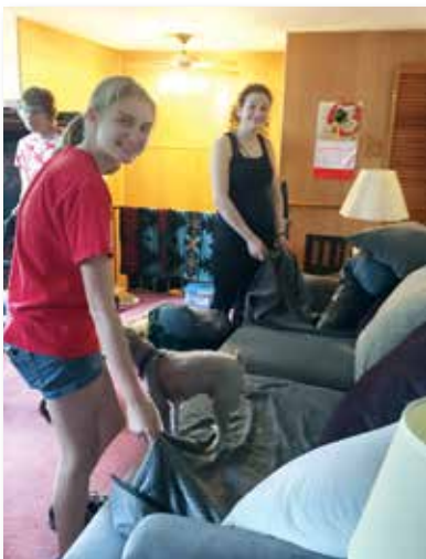
Photo above and left: Juniors from St. Louise De Marillac helping a fellow parishioner.

Windows were cleaned, furniture dusted, carpeting vacuumed, refrigerator sanitized and floors swept. They also swept and tidied up the rear porch area. To complete their project, a man from the parish will donate his time to replace a railing. The recipient was very grateful and the Juniors enjoyed spending their time, strength and energy helping someone in need. The beauty of the clean environment left behind, filled with the goodness of the Juniors, is a simple but tangible example of reaching out to someone living on the margins of society.