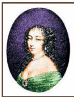
Marie Madeleine de Vignerot