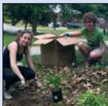
JLOC Newscast Page 8