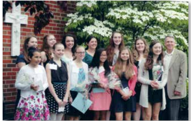
New Juniors in Albany are beaming after their installation.

prepare the girls by sharing the history of the founding of the Ladies of Charity, Daughters and Sisters of Charity and Juniors as part of the Vincentian Family. The group is inviting Ladies of Charity to visit and share some of the wisdom gained through their ministries.