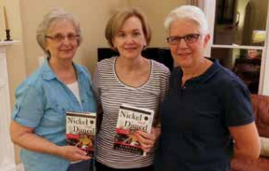
Above and below: The Ladies of Central Alabama held a discussion of Nickled and Dimed by Barbara Ehrenreich, a book which had been recommended on Famvin.