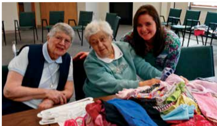
Daughters of Charity help sort children's clothing for Mary's Corner.

young children. The participants inspected the clothes and put together over 300 outfits. The Daughters enjoyed this Saturday the most, doing ministry work again. A barbecue in June was another successful event as many Ladies brought their family and friends and people of all ages participated.