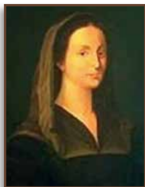
Duchess of Aiguillon

Twenty-three year president of the Ladies of Charity of Hôtel-Dieu, Paris, wealthy, influential and extremely giving, Marie Madeleine de Vignerot, better known as the Duchess of Aiguillon, was one of the closest friends and collaborators of Vincent de Paul in his work for persons living in poverty.