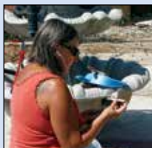
GMAC in Utah Page 6