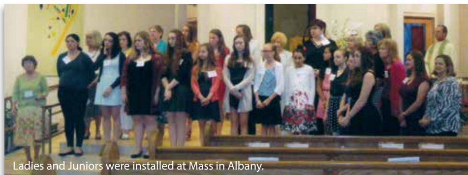
Ladies and Juniors were installed at Mass in Albany.