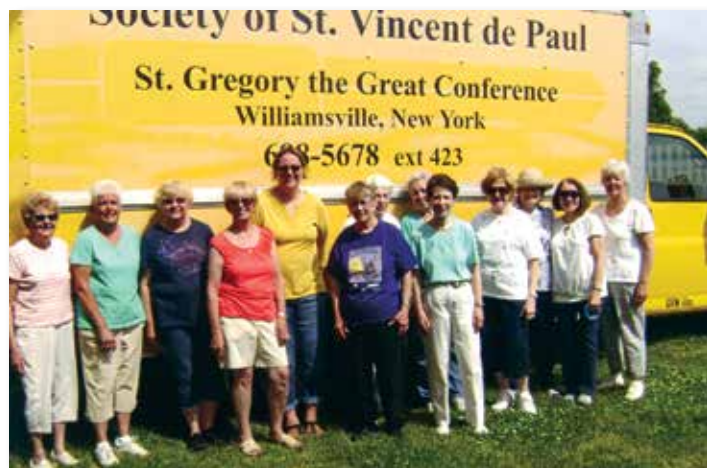
Ladies of Charity of St. Greg's loaded an SVDP truck with donations for the diocesan LOC Center.

L adies of Charity (LOC) who volunteer in the Lots of Clothes Thrift Store sort clothing donations carefully. Garments which are inappropriate for the store (soiled, out of season or badly out of date) are bagged and saved for the Society of St. Vincent de Paul (SVDP). For the year 2015, through mid-August, 720 bags of clothing and 23 boxes of other miscellaneous merchandise have been donated.