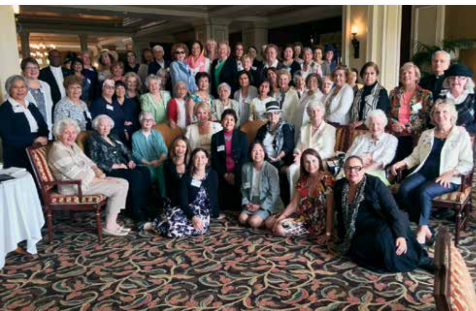
Below: Ladies of Charity in Los Angeles at their annual Hundred Committee Tea in May.