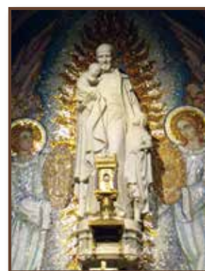
Vincent's heart in reliquary, Daughters' chapel, Paris

Fifteen years later, in 1675, the Duchess of Aiguillon died. Having used her wealth, position and influence for good, she impacted the lives of impoverished people throughout the region. Her memory brought tears to the eyes of the vast crowd who attended her funeral. Without a doubt, Marie's legacy lives on even today as the Ladies of Charity of the twenty-first century continue to follow in her footsteps.