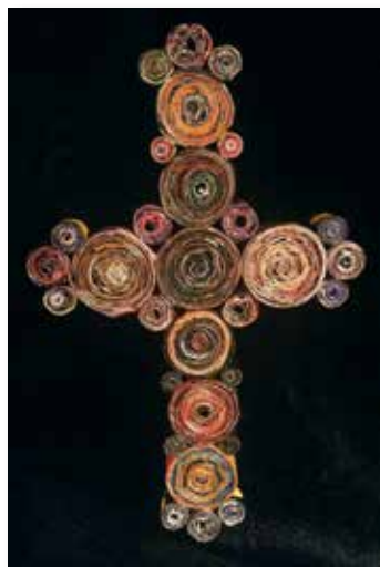
The little cross that could.

Pleased with the results, she "posted (boasted)" it on Facebook. Several people wanted to buy it, but she had only the one. The idea of an auction developed. She informed bidders that the proceeds would benefit the Ladies of Charity, a Vincentian organization that helps the less fortunate. "A friendly and energetic bidding war ensued." The popular little cross gained much attention and at the auction's