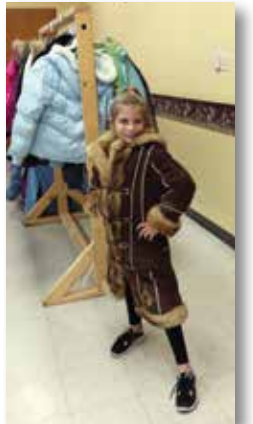
This little girl wouldn't remove her "like new" coat she had chosen from approximately 2,000 coats and jackets available at the Albany, N.Y. LOC Coats for the Community event.