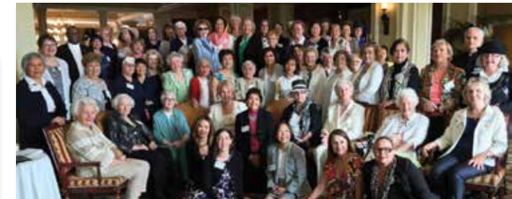
Los Angeles LOC held their 52nd Annual Hundred Committee Tea, with proceeds promoting their many works of mercy.