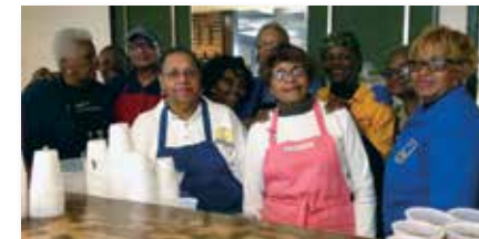
The Ladies of Charity of the Archdiocese of Washington truly believe in "Welcoming the Stranger." They fed more than 73,677 people in 2015.