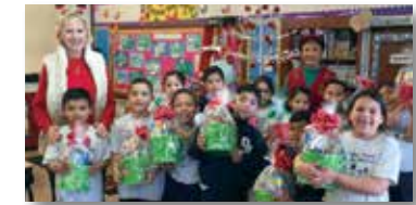
The children at the Guardian Angel School were thrilled with the Christmas baskets prepared by the Los Angeles LOC.