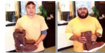
Workers could not be employed until they had construction boots, which were happily supplied by LOC in Nashville through their "Soles4Souls" program.